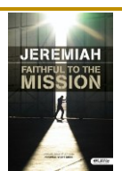
January Bible Study

Read the Courier to learn about current Baptist news and the work of SC Baptist. For more information visit BaptistCourier.com .